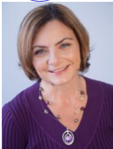
A Message From Your Association Executive