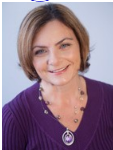
A Message From Your Association Executive