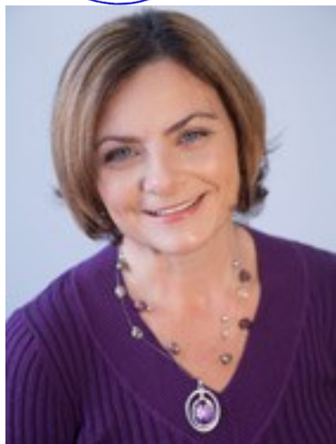
A Message From Your Association Executive