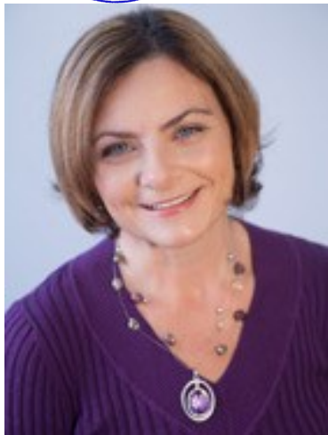
A Message From Your Association Executive